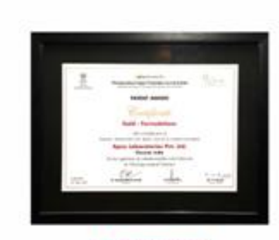
Pharmexcil Patent Award - Gold (Formulations)