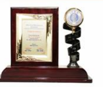
IDMA Plaque of Honour