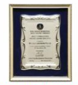
IDMA MARGI MEMORIAL Best Patent Awards (Formulations)