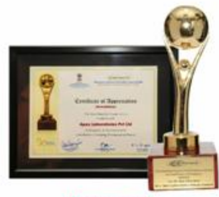
Pharmexcil Certificate of Appreciation (Formulations)